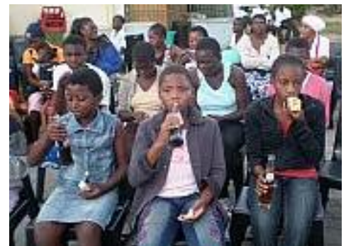
The children enjoying drinks and cakes at the Trust's 17th anniversary