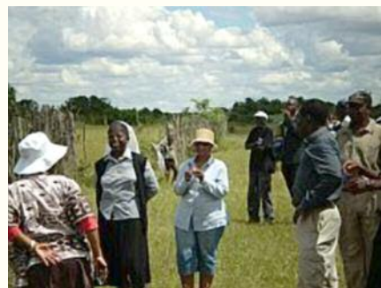
Board members taking a tour of the projects the trust operates in Mhondoro which generate income for the orphanage.